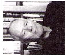
Dr. Stephen Ambrose, 1936–2002