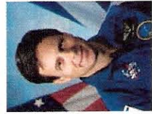
Col. Ilan Ramon, 1954-2003

We encourage you to visit and learn more about the National D-Day Museum. For further information, please contact: National D-Day Museum, 945 Magazine Street, New Orleans, LA. 70130. http://www.ddaymuseum.org