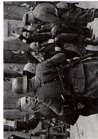
Jews captured during the Warsaw ghetto uprising. Warsaw, Poland

The Museum has designated "For Your Freedom and Ours" as the theme for the 2003 Days of Remembrance in honor, and in remembrance, of those courageous individuals in the Warsaw ghetto who valiantly rose up against their Nazi oppressors sixty years ago.