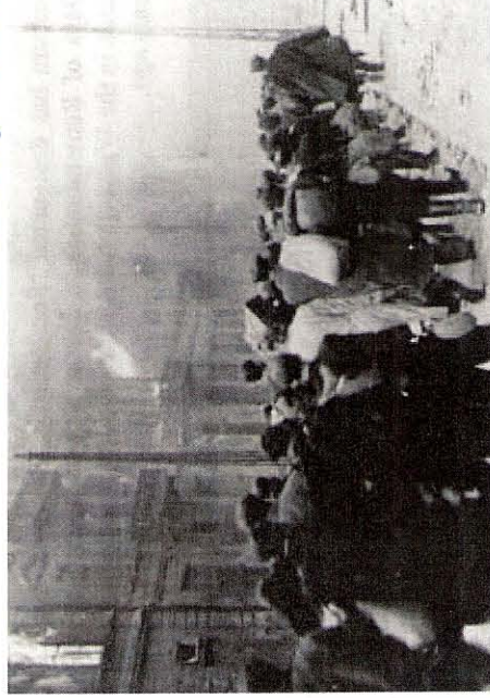
Deportation from the Warsaw ghetto during the ghetto uprising, Warsaw, Poland, May 1943.