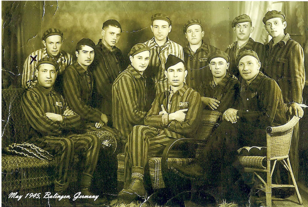
May 1945, Balingen, Germany